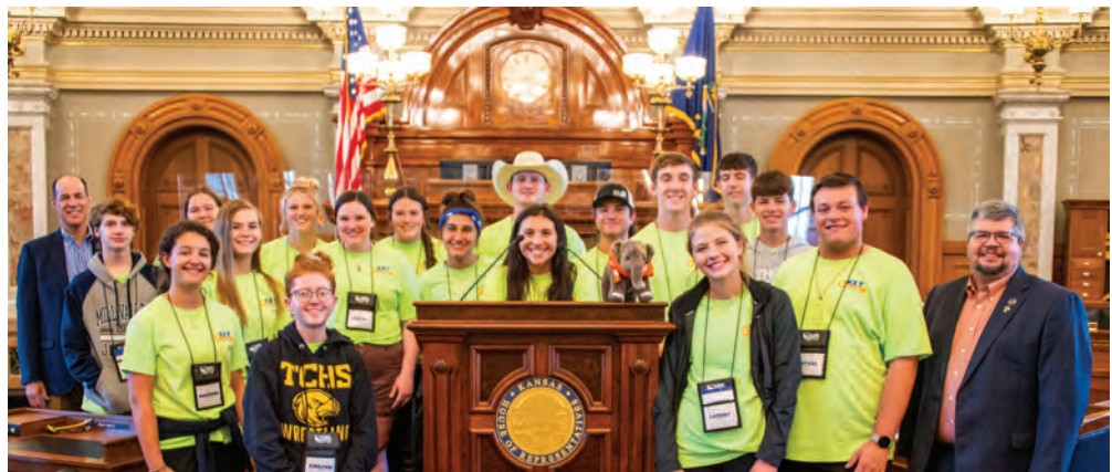
The 2022 KEY delegates gather at the Kansas State Capitol in Topeka.