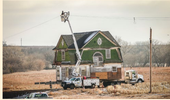
RHEC crew assisting with raising power lines for the house move.

▶ WEBSITE : http://nursingbacktolife.com/