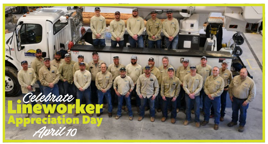
Rolling Hills Electric honors the men and women who keep our lights on.

Rolling Hills Electric invites all coop members to take a moment and thank a lineworker for the important work they do. On April 10, you can use #ThankALineworker on social media to show your support for the brave men and women who power our lives. We're extremely grateful to have such a dedicated and hard working crew!