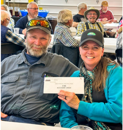
Members won bill credits as part of the prize drawings.