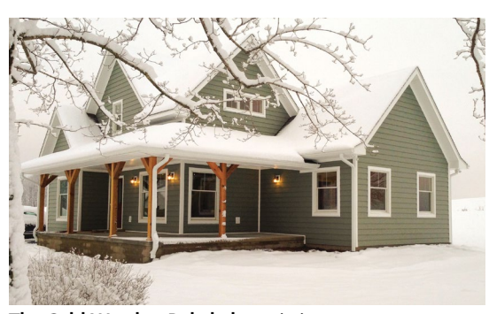
The Cold Weather Rule helps existing consumermembers maintain electric services during the winter.

Rolling Hills Electric Cooperative Inc. wants consumermembers to have the electric service needed to keep their homes warm during the winter. Rolling Hills Electric also recognizes the member's responsibility to make contact to establish payment arrangements. When we work together it ensures both goals are met.