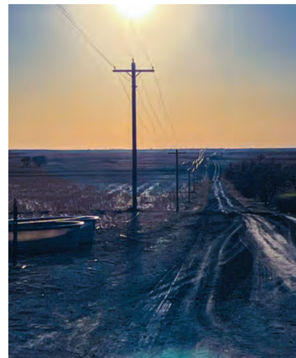
These pictures taken in the Covert substation area are about eight hours apart. There were approximately 30 poles down on this section of line that needed to be replaced. Kudos to our crews who work hard to get power restored to our members as quickly as possible!

safely to restore power. Also, a big thank you to our crews who were out working in the harsh and dangerous conditions, working long hours to restore power to our members.