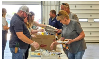
Co-op employees serving up kindness, one meal at a time!