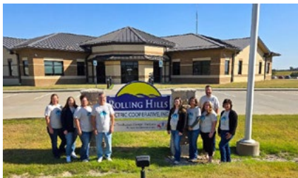
The Co-opportunity Day Picnic showcases teamwork at its best!