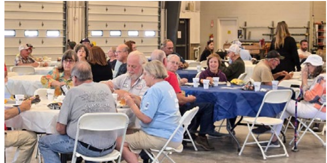
Co-op members share more than just a meal — bringing comfort, kindness and community to the table.