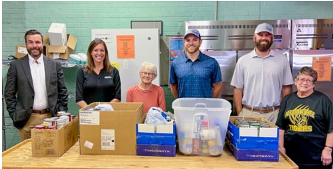
See community support in action! We were proud to deliver food to our local pantry, helping neighbors in need.