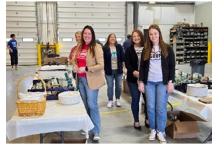
Co-op employees gave back to our community by serving at the Co-opportunity Day Picnic.

A large number of food items were collected that were donated to the Mitchell County Food Pantry.