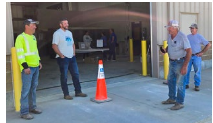
Welcoming with care — RHEC employees were on hand to guide each guest in.