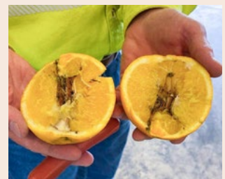
These pictures show what could happen if an individual contacts a power line. Using an orange to represent a heart, kids can see the inside of the orange is burnt after contact with a live line.

Lincoln County Kids were shocked to see the "what could happen to you" electrical demonstration.