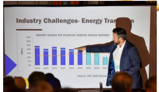
Rabe discusses the highs and lows of industry challenges.