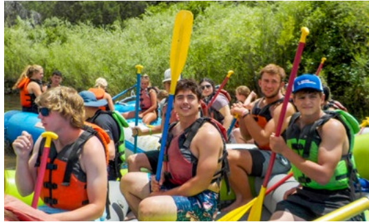
A highlight at camp each year is rafting on the Colorado River.

CYLC wasn't just about professional development; it also embraced the spirit of camaraderie and adventure. Students ventured to Mount Werner, downtown Steamboat Springs and went white water rafting on the Colorado River. Students also participated in various recreational activities including a volleyball tournament, swimming, a talent show, and a dance.