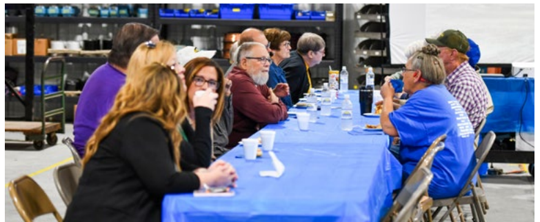
Community members enjoyed breakfast pizza, doughnuts and coffee at the opening of our new building.