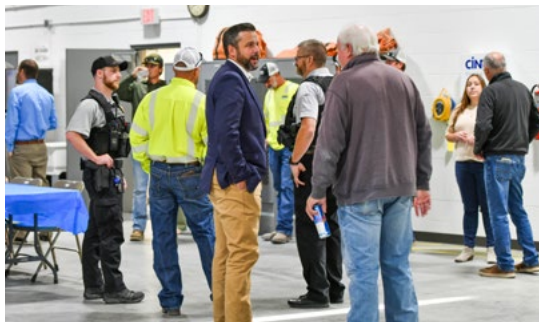
RHEC employees and community members visit during the open house.