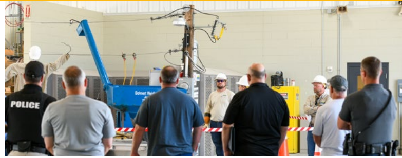
First responders from the Rolling Hills service territory attend an electrical safety demonstration.

Utility companies and traditional first responders often work hand in hand during emergencies. When natural disasters