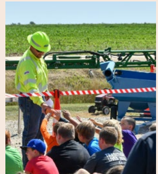
An orange burned during the demo was passed around so kids could see the effects of coming into contact with power lines.