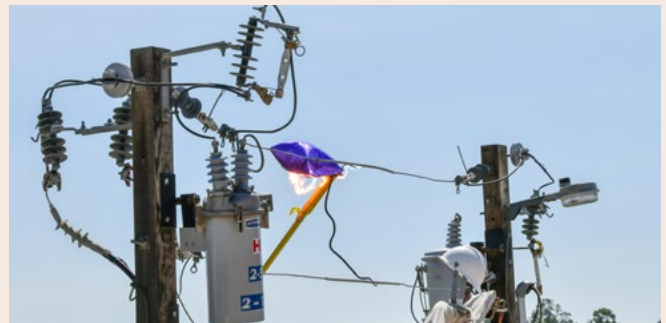
A mylar balloon demonstrates to the fourth-grade audience what happens when balloons come into contact with power lines.