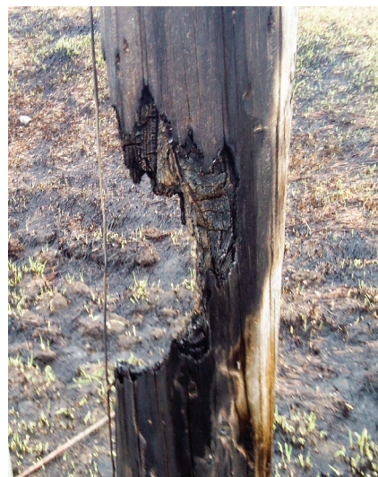
Before burning, check the property for electrical equipment and power poles to avoid damage and potential outages.

tion and weeds at least 4 feet around the base of the pole.